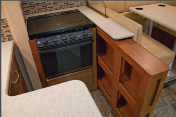
ROOM TO GROW

Check-out the space in the kitchen. The microwave, sink and oven are all within arms reach. An ingenious slide-out pantry is tucked away and can be extended to provide additional counter space. The kitchen drawers open towards the living area, so when cooking, the utensils can be easily accessed.