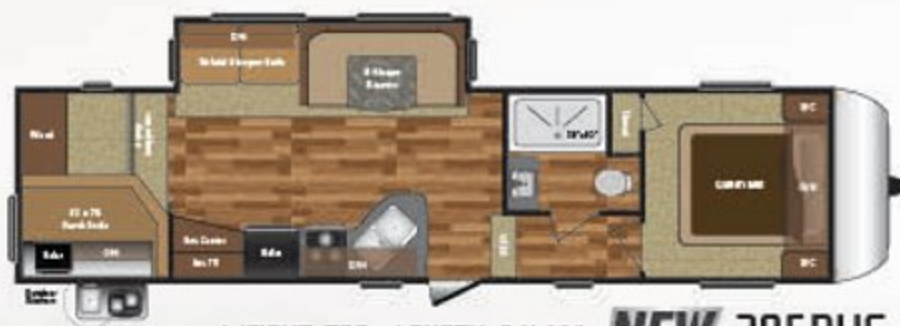
WEIGHT: TBD LENGTH: 34' 11" NEW 295BHS