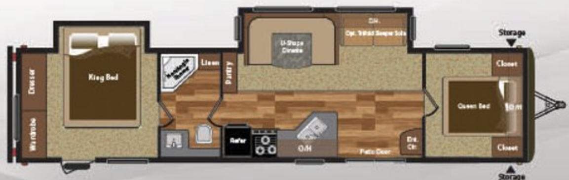
WEIGHT: 8363 LENGTH: 39' 11" 38FQDS