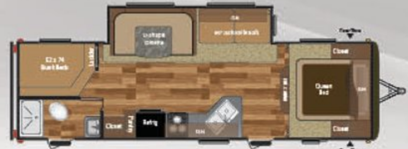
WEIGHT: 6600 LENGTH: 32' 3" 280LHS