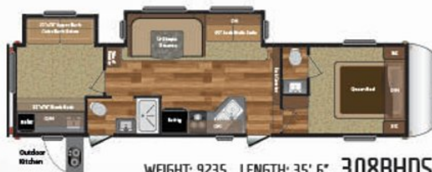
WEIGHT: 9235 LENGTH: 35' 6" 308BHDS