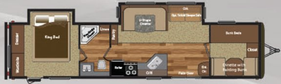
WEIGHT: 8348 LENGTH: 39' 11" 38BHDS

Hideout's bedrooms provide spacious sleeping quarters and loads of storage space for a great night's sleep.