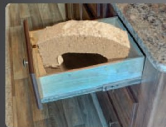
FULL EXTENSION BALL BEARING ROLLER GLIDES