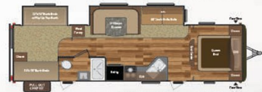
WEIGHT: 7681 LENGTH: 35' 8" 310LHS