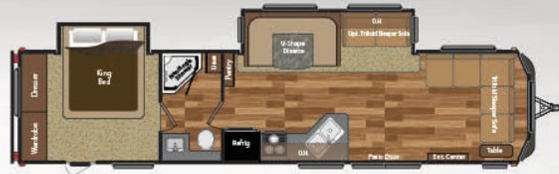
WEIGHT: 8284 LENGTH: 39' 11" 38FDDS