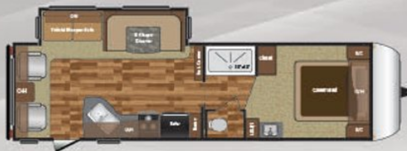
WEIGHT: TBD LENGTH: 30' 4" NEW 276RLS