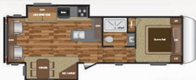
WEIGHT: 8040 LENGTH: 31' 1" 299RLDS