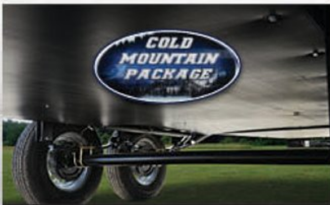
HEATED & ENCLOSED UNDERBELLY