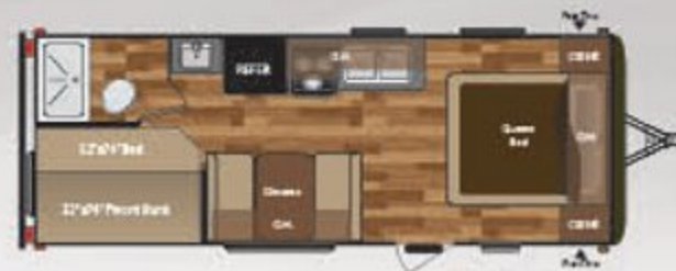
WEIGHT: 4590 LENGTH: 25' 4" 210LHS