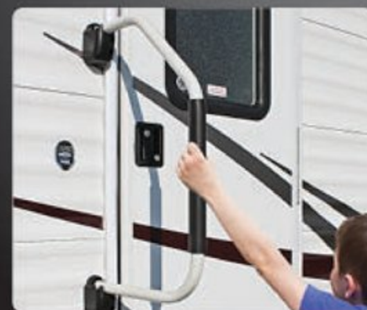
XL EXTENDED GRAB HANDLE