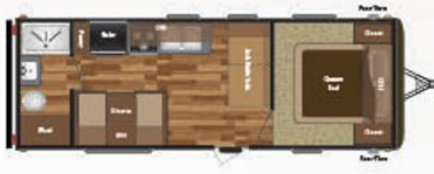
WEIGHT: 4700 LENGTH: 25' 11" 230LHS