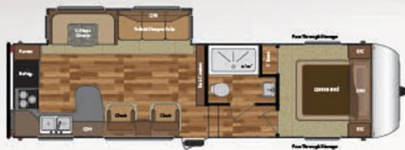
WEIGHT: 8070 LENGTH: 32' 1" 282RKS