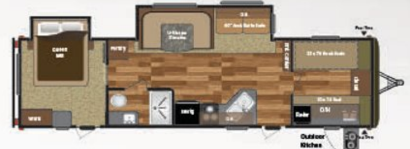
WEIGHT: 8055 LENGTH: 35' 0" 300LHS