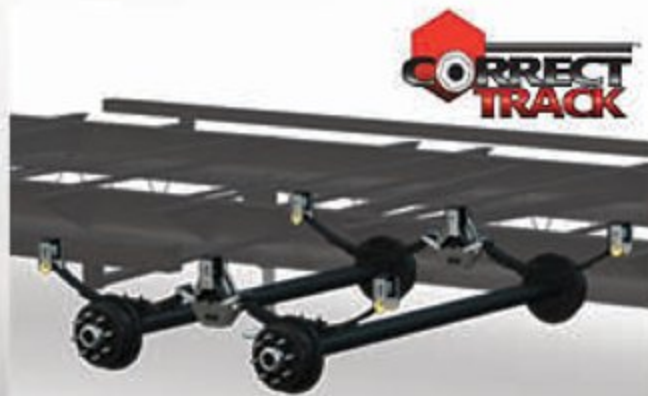
CORRECT TRACK ALIGNMENT SYSTEM