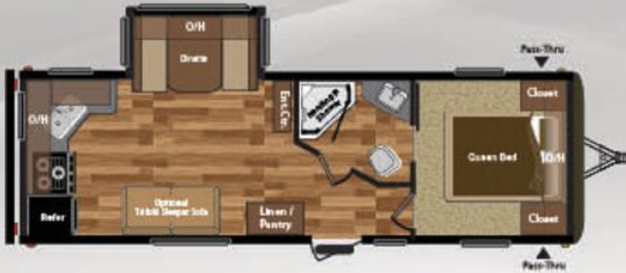
WEIGHT: 6039 LENGTH: 29' 8" 25RKS