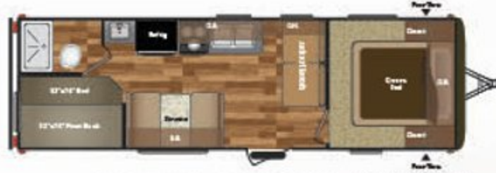
WEIGHT: 5020 LENGTH: 29' 3" 260LHS