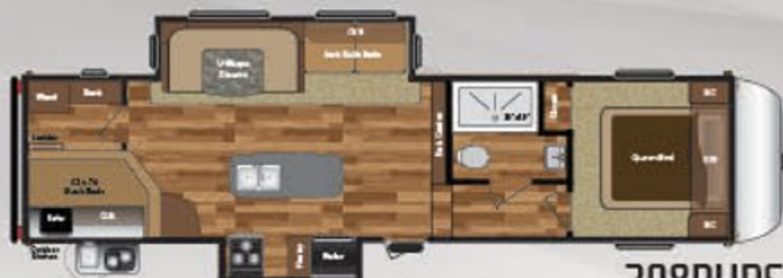
WEIGHT: 9045 LENGTH: 34' 11" 298BHDS