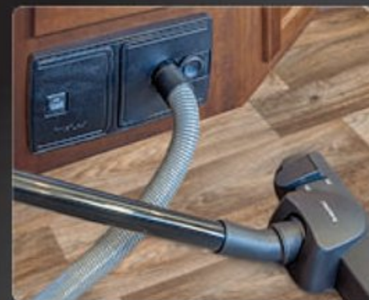
CENTRAL VACUUM SYSTEM

RELAX...THERE'S A HIDEOUT FLOORPLAN THAT WILL MEET ALL OF YOUR FAMILIES NEEDS. WITH A UNIQUE LINEUP OF FLOORPLANS THAT ARE LOADED WITH STANDARD FEATURES, HIDEOUT'S RESIDENTIAL STYLE INTERIOR IS YOUR HOME AWAY FROM HOME.