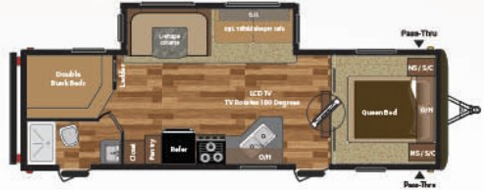
WEIGHT: 6760 LENGTH: 32' 3" 28BHS