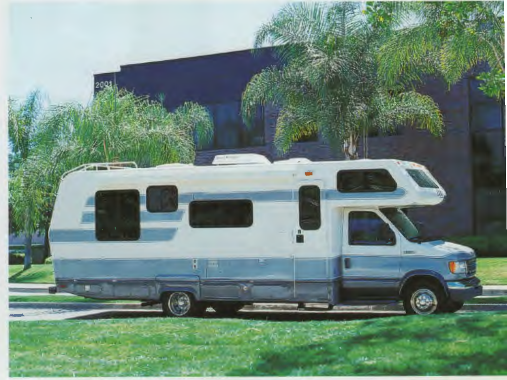
261/21 Island Bed

Let there be no doubt, the Lazy Daze will attract that admiring second glance from everyone. Considerable effort has been put forth to design a motorhome with "classic clean lines", no faddish designs that will eventually become dated. The new Lazy Daze exterior profile and graphics emphasizes a sleek, smooth, streamline look of the future, without sacrificing its identity to the past. This, coupled with the quality of workmanship in our motorhome, creates that good feelina called. "Pride Ownership".