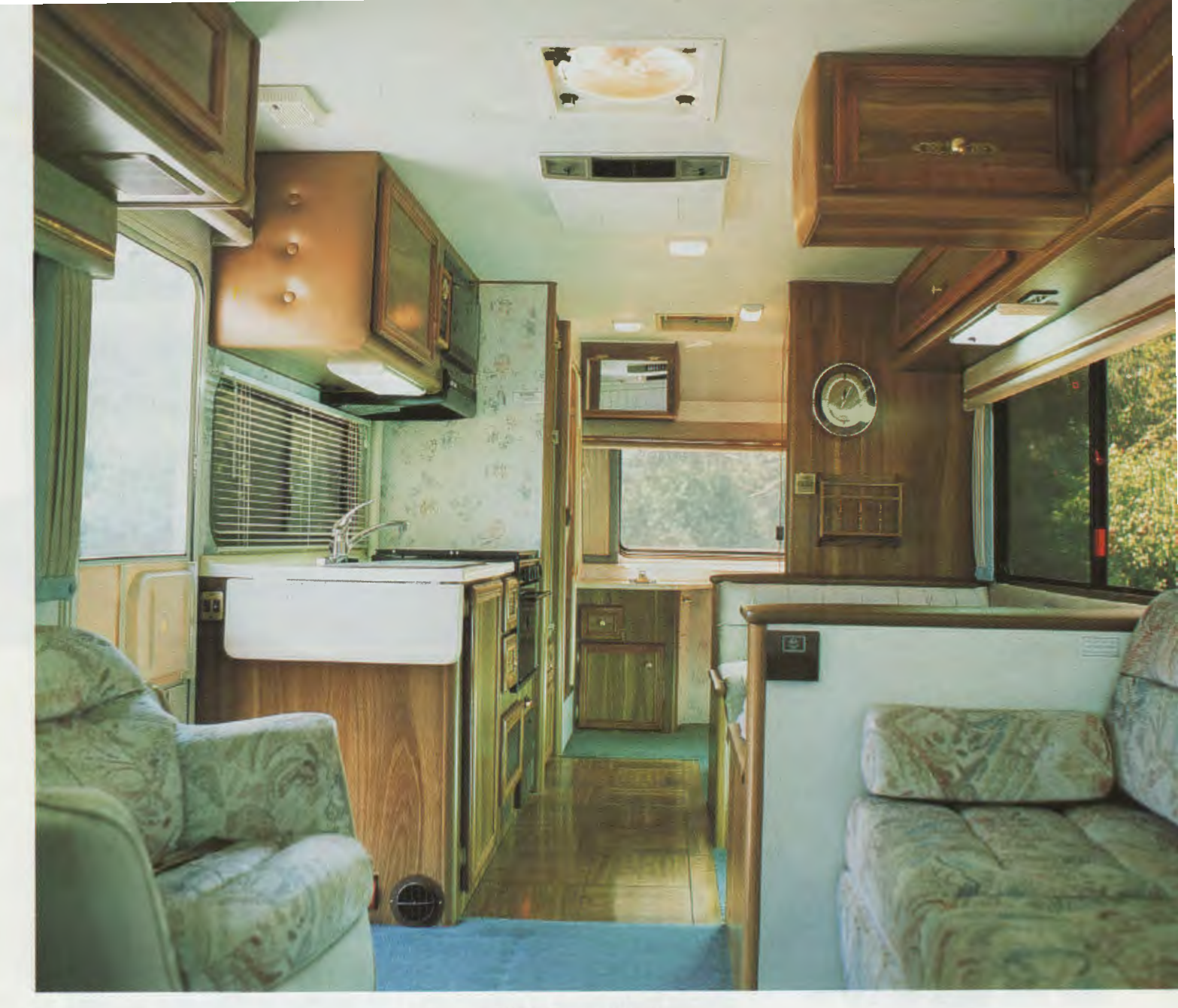
261/21 Rear Bath