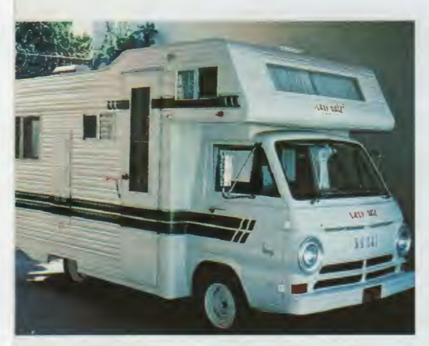
LAZY DAZE 16' CLASS "C"-1966 Available to see in our showroom.

There is no substitute for experience. Lazy Daze has been designing, manufacturing and selling RV's since 1956. In 1966, we designed, built and offered for sale the first minihome in America.