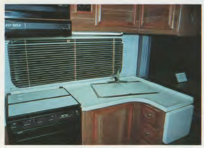
Counter Top 231/21 Front Dinette

When a motorhome weighs less, the vehicle has a better power weight ratio, and consequently better gas mileage. Many of the "big" motorhomes are only reporting from 4 to 6 m.p.g. Our design theory is: "Build the motorhome with as low a silhouette as possible, with an aerodynamic profile, and as light as possible without sacrificing strength and quality"