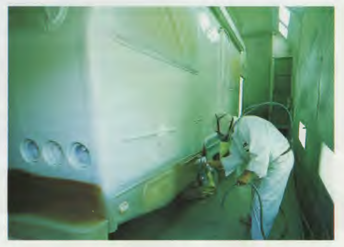
Motorhome Being Custom Painted