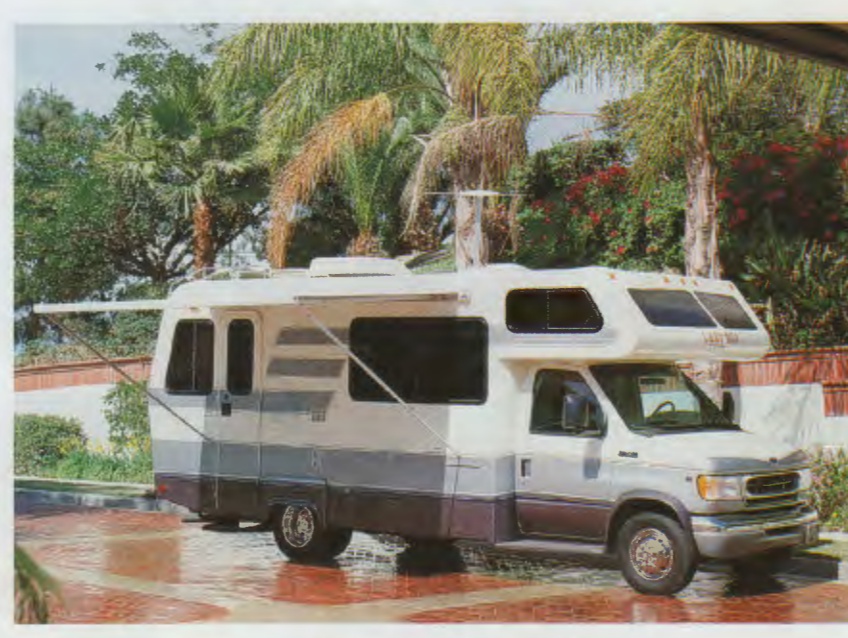
231/21 Front Dinette