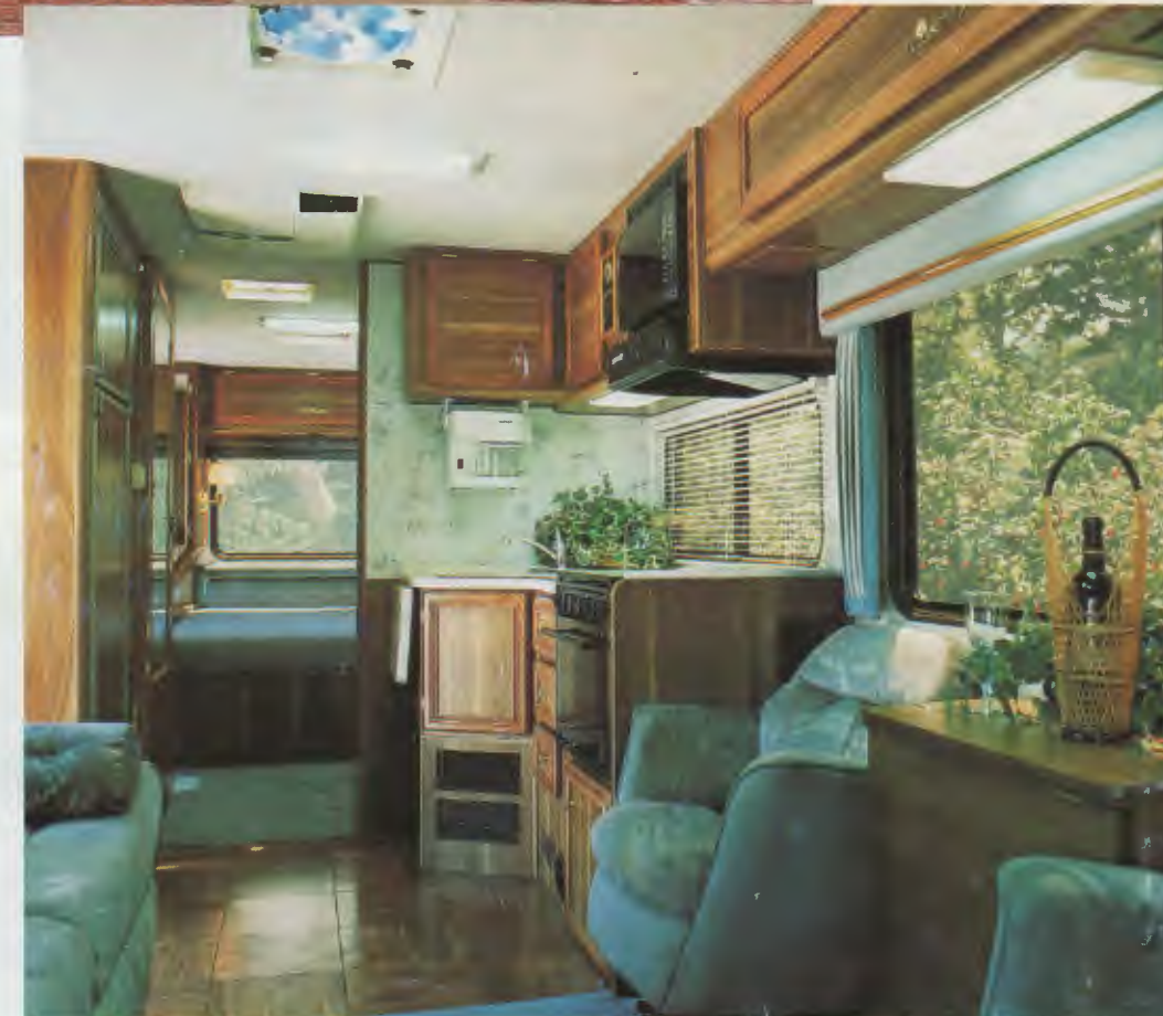
30' Island Bed

DETAILED SPECIFICATIONS CAN BE FOUND ON THE BACK SIDE OF THE FLOOR PLAN PAGE.