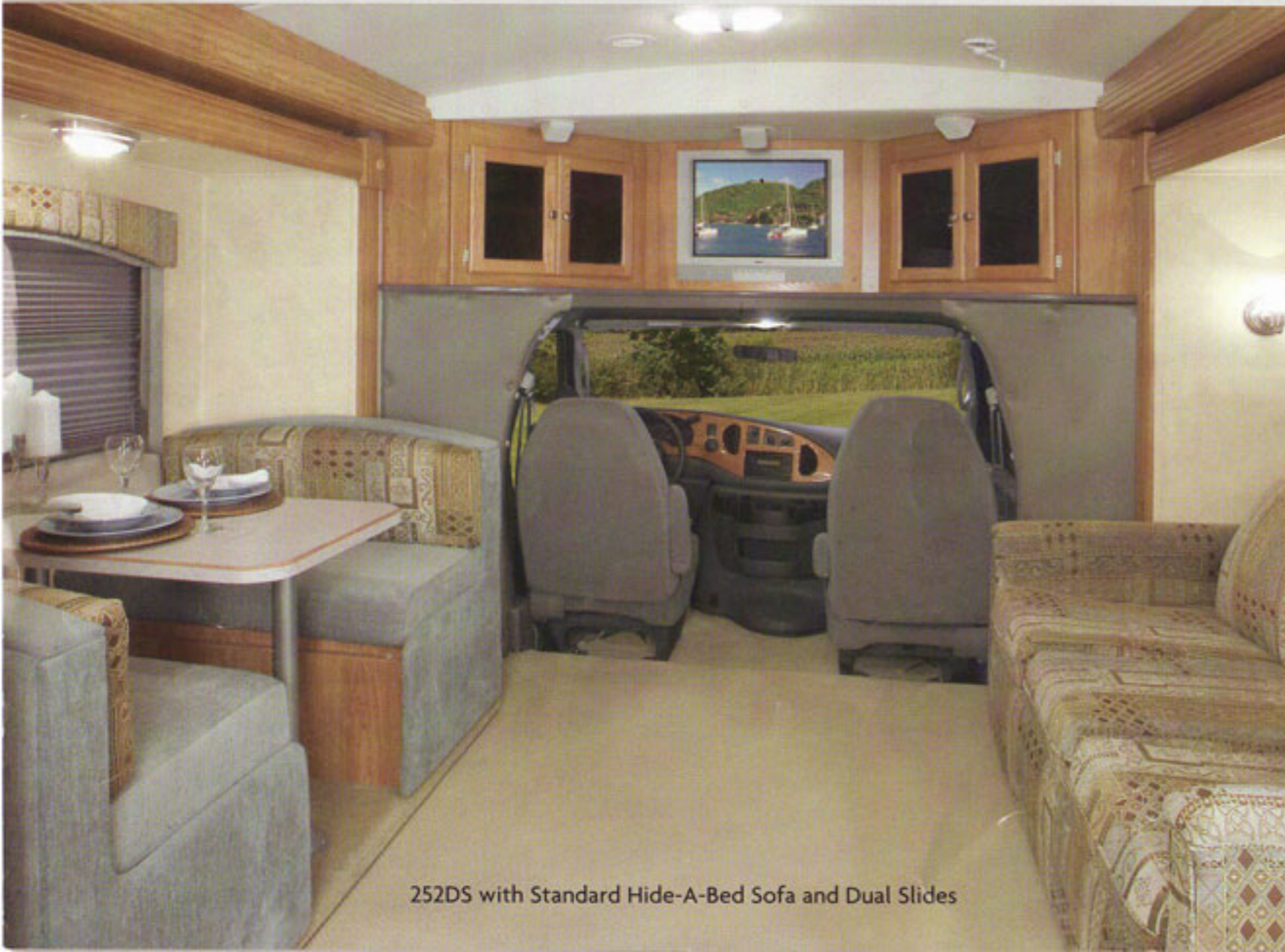
252DS with Standard Hide-A-Bed Sofa and Dual Slides