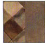
◀ Floating Squares