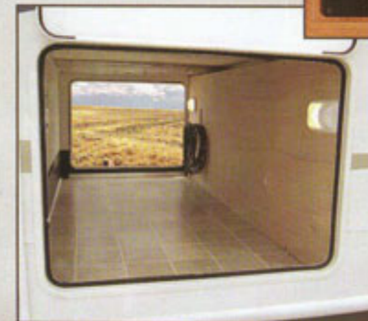
Model 285 Rear Pass-Thru Compartment