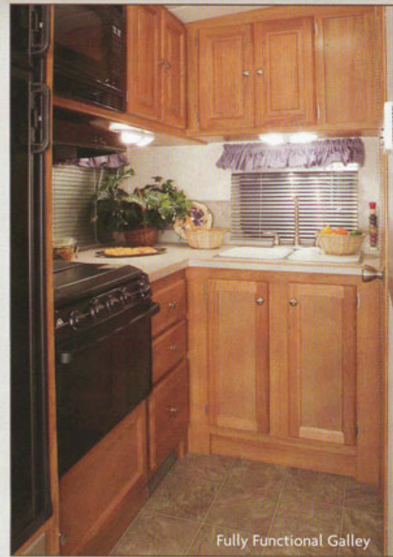
Fully Functional Galley

handsome cabinetry, plush sofa, dinette, entertainment center (optional), and roomy sleeping accommodations. Storage space has not been neglected. An abundance of storage features, as well as a large exterior pass-through storage compartment (285), lets you conveniently stow all your camping gears and supplies. All this is created with quality craftsmanship that ensures long-lasting value.