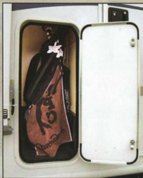
Model 213 Utility Storage